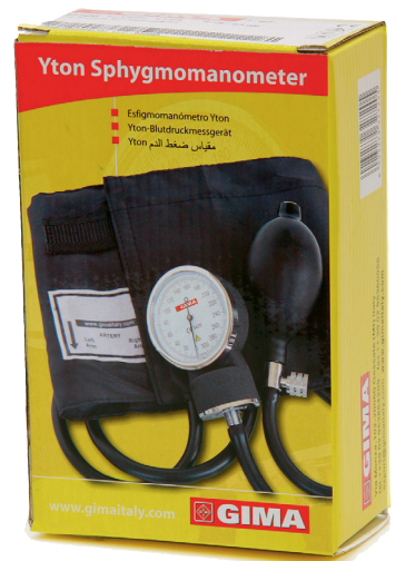
32720 Yton sphygmomanometer