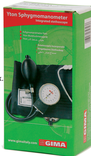
32703 Yton with incorporated Stethoscope